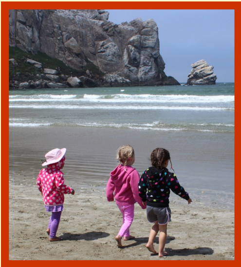
Do you have a favorite photo to share??