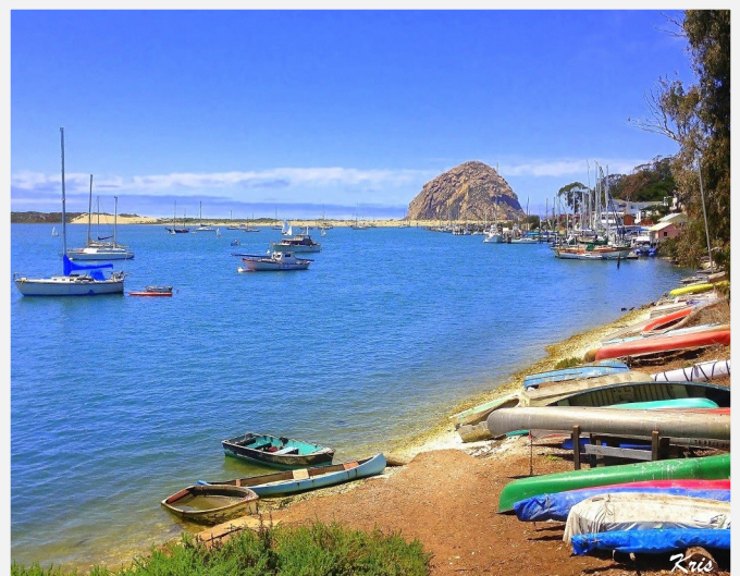
Another Gorgeous Day in Morro Bay!